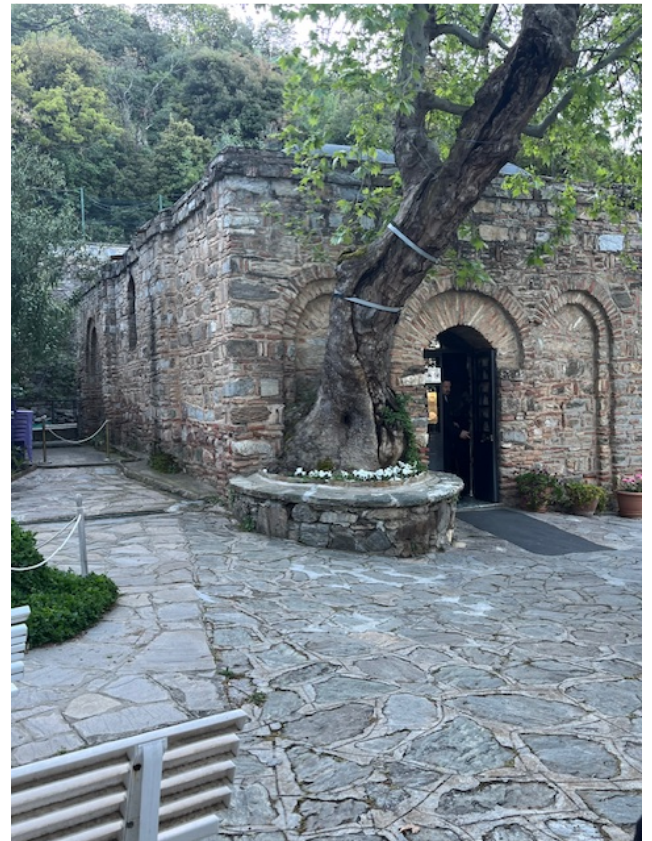
Front of Mary's House