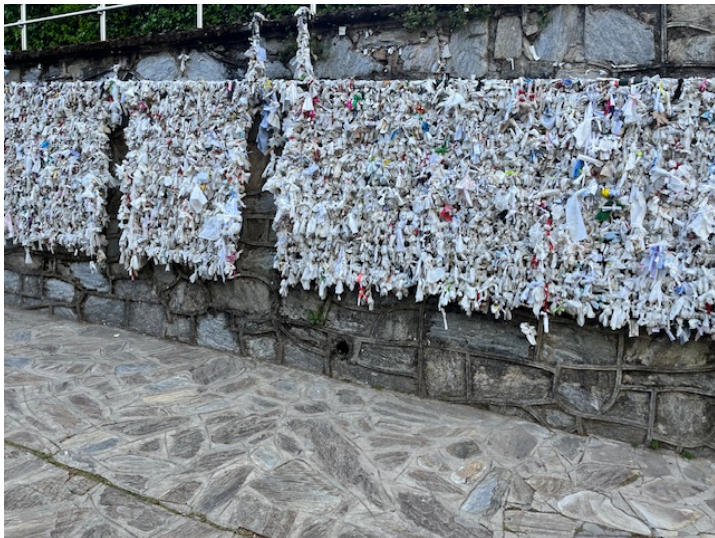
Prayer petitions on a fence near Mary's house.