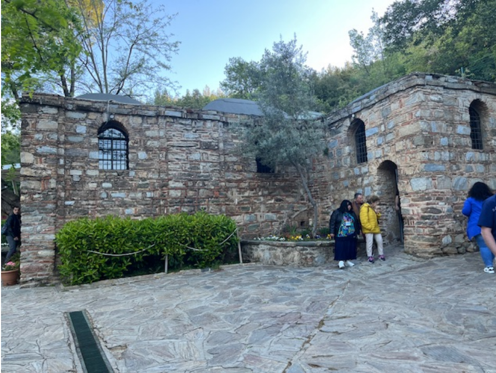
Back of Mary's House